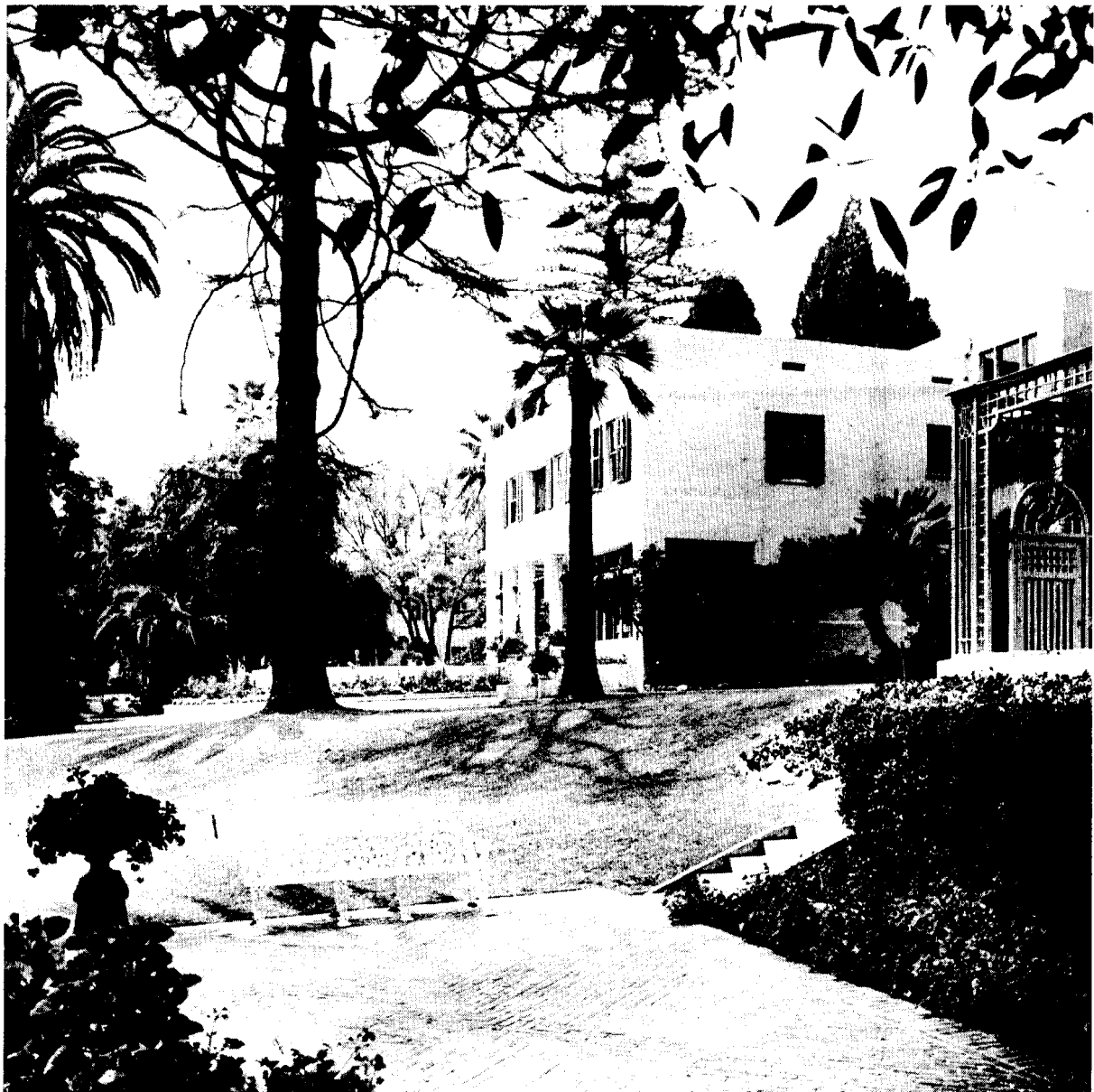
One of four patios on our picturesque AMBASSADOR COLLEGE campus